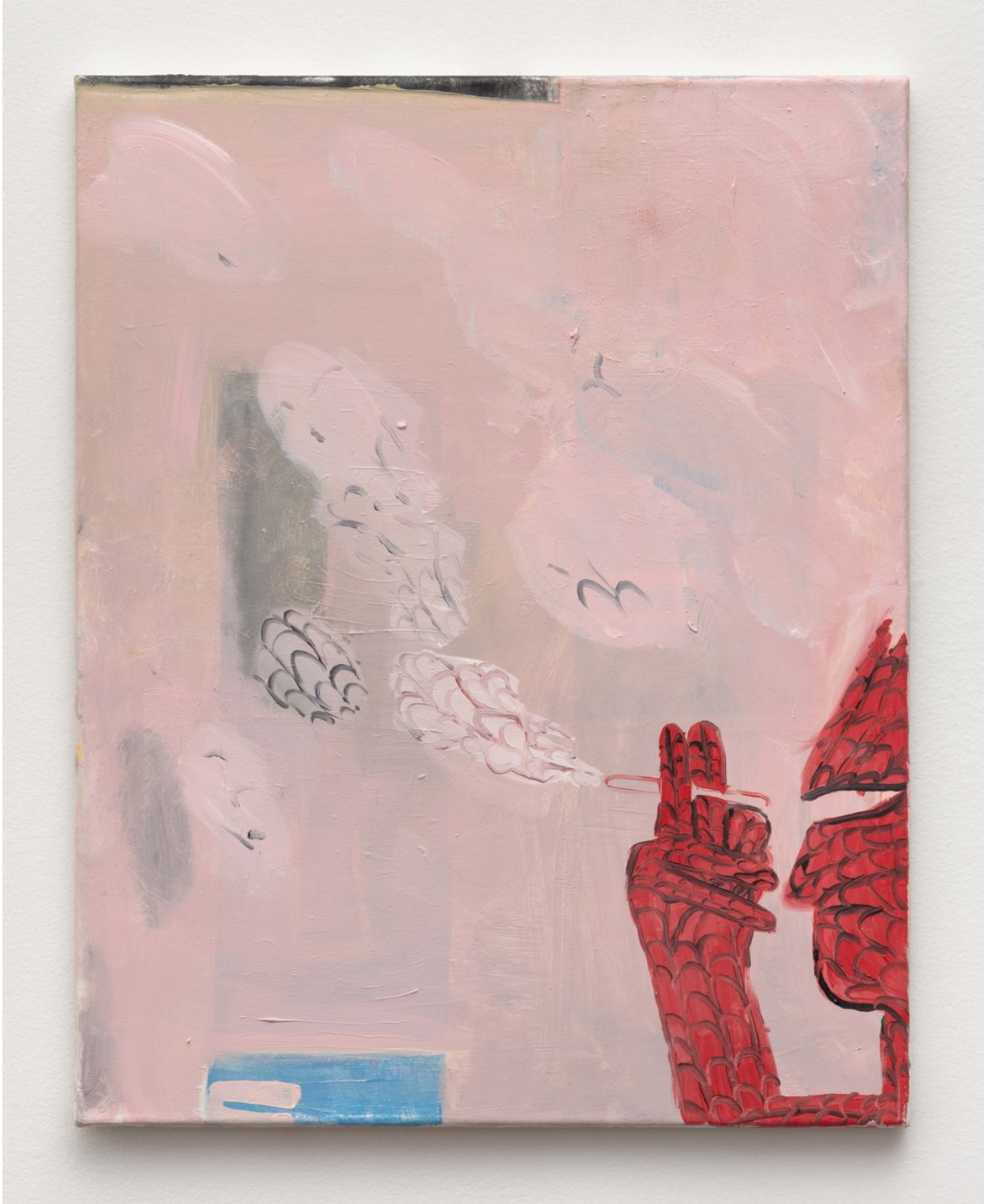
Bernice Nauta Spidey me 3 , 2019 Oil on canvas 50 x 40 cm (19 5/8 x 15 3/4 inches)