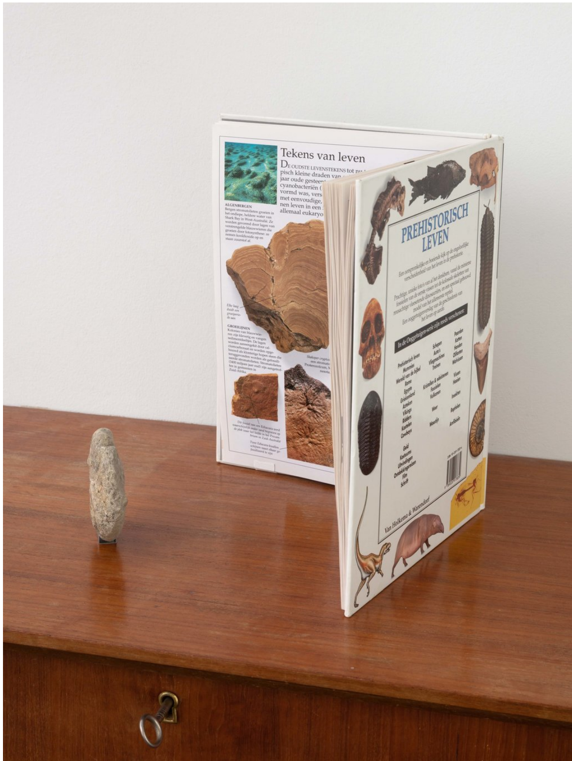
Bernice Nauta Untitled , 2019 Book, fossil, staples Dimensions variable